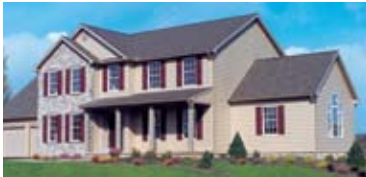
CUSTOMIZED WESTMINSTER II