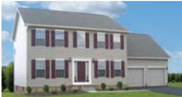
STANDARD WESTMINSTER I